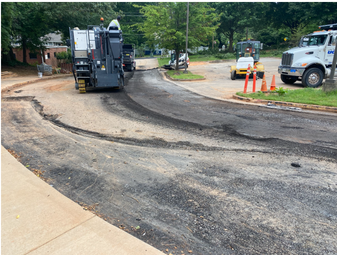
Begin milling and asphalt paving