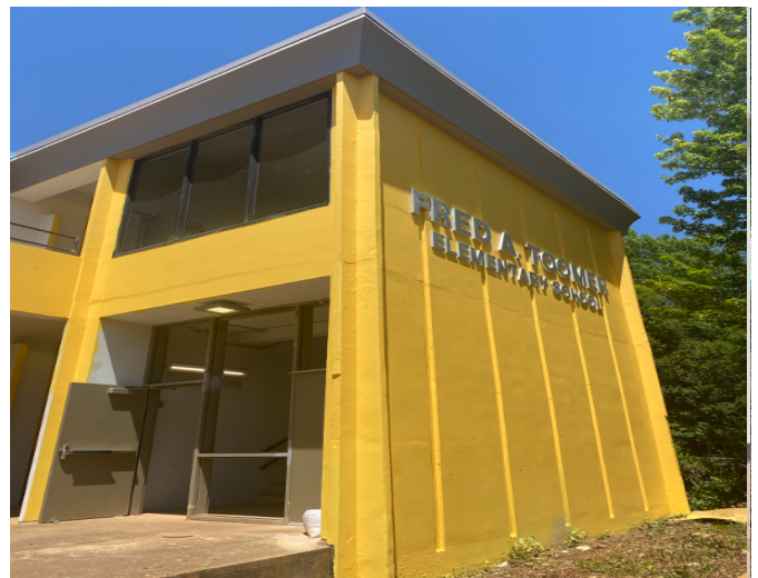
Dimensional letter signage installation complete